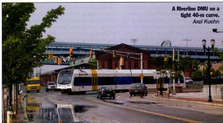
A Riverline DMU on a tight 40-m curve. Axel Kuehn

What one would perhaps need to accept in urban streets is a diesel rail vehicle as seen in Zwickau and Camden. We acknowledge it everywhere for buses, lorries and private cars, and we are certainly not speaking about pedestrianised areas being polluted by three-minute metro-like train frequencies. It is more about ordinary streets and roads and headways, which may result in just six trains per hour in