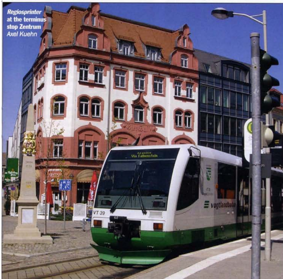
Regiosprinter at the terminus stop Zentrum Axel Kuehn

city centre. Zwickau did receive proper political support for this pilot project, which is expressed also in the fact that the public funding for the dual-gauge track section was 100%, while the usual funding rate in Saxony was 75%. The total costs for the first section of the tramway project (Neumarkt-Schedewitz) were estimated to be DEM 46 million, Zwickau received DEM 34.5 million in public funding; for the Vogtlandbahn integration a further DEM 35.6 million was received.