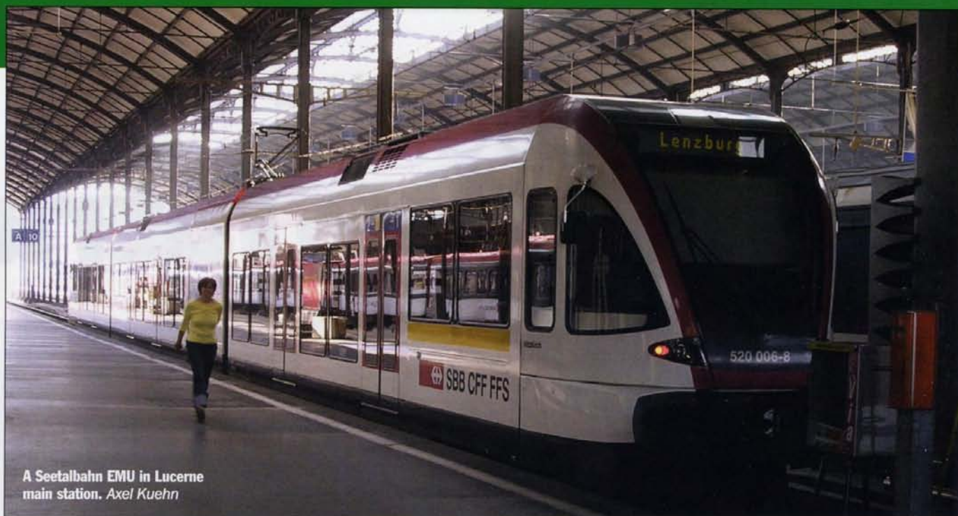
A Seetalbahn EMU in Lucerne main station.

introduced, while on other parts the maximum speed allowed was increased to 80km/h. Beyond this the Seetalbahn measure package also included more passing loops, additional stops, a new central control centre in Lenzburg, certainly removal of as many level crossings and improving the safety of others. The total investment was EUR 130 million.